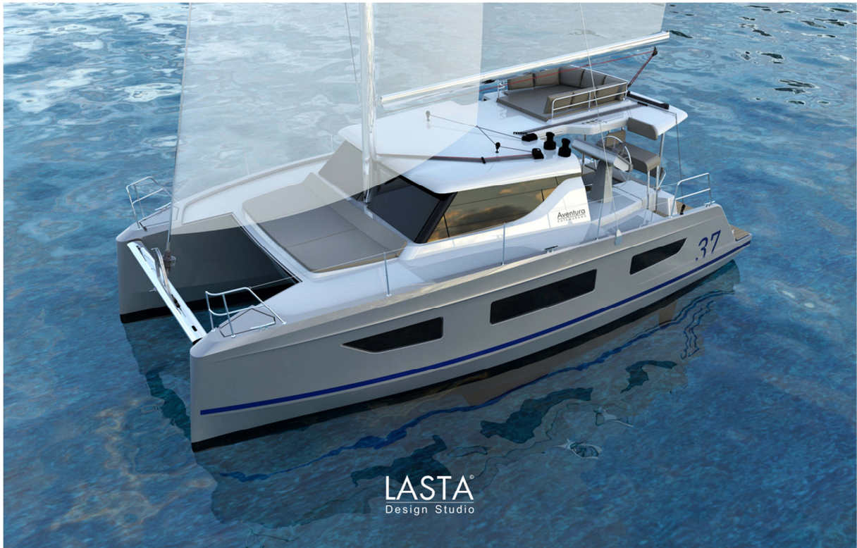
AVENTURA 37 World-premiere at the La Grande Motte Multihull-Show 2021 with cat sale