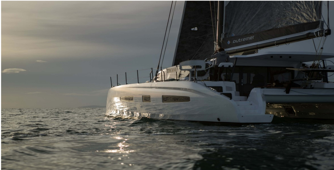
OUTREMER 55 N°1 under sails for first sea trials on the Med with cat sale