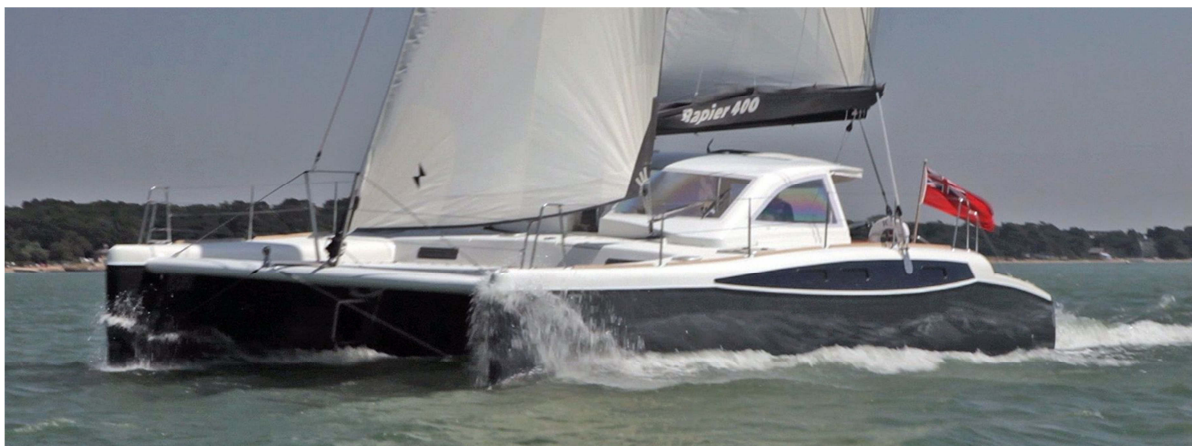
RAPIER 400 Performance Line by Broadblue, an open concept

The Broadblue 346 cruising cat designed by Darren Newton with the Dazcat design office is built in Szczecin / Poland and combines modern design with English style and well-founded Polish boat construction. With a length of only 10.2m, this catamaran offers excellent sailing performance. Designed for a maximum of six people in two double cabins aft and two single cabins in the bows, the interior proves to be extremely voluminous and comfortable even on long voyages. Class A certified for deep sea sailing with a wave height of more than 8m, as well as, due to the compact width, suitable for inland areas and lock passages, this catamaran offers a huge potential for use.