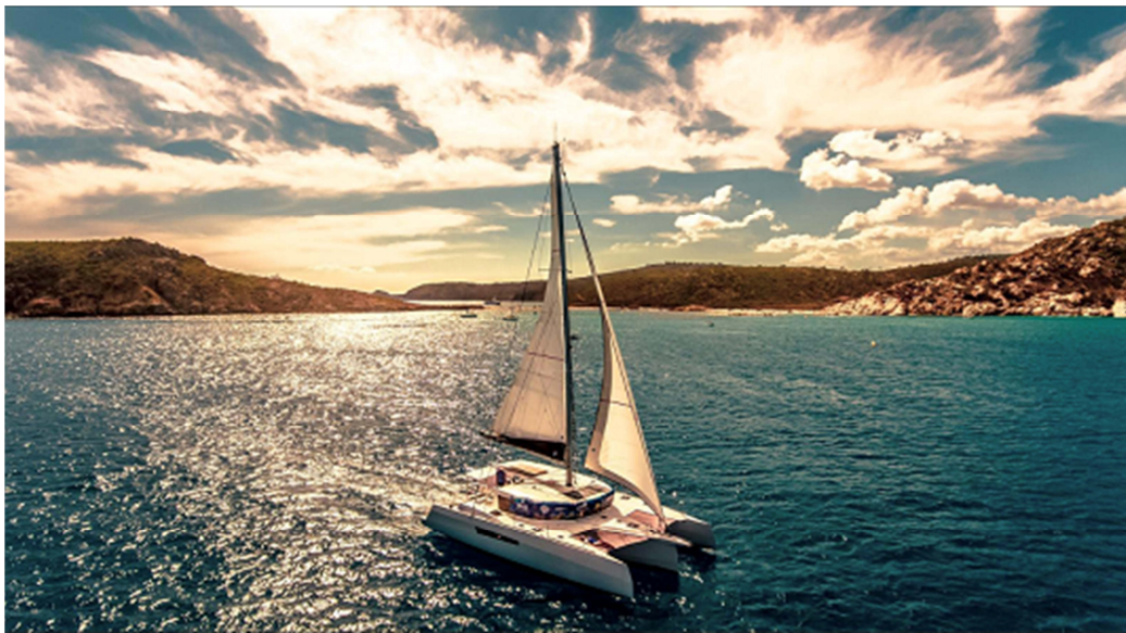
NEEL 43 – N°1 under construction / World-premiere in April 2021 with cat sale