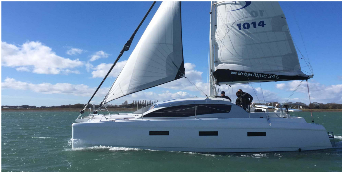
Broadblue 346 as well presented at the Multihull-Show mit cat sale

The Broadblue 346 cruising cat designed by Darren Newton with the Dazcat design office is built in Szczecin / Poland and combines modern design with English style and well-founded Polish boat construction. With a length of only 10.2m, this catamaran offers excellent sailing performance. Designed for a maximum of six people in two double cabins aft and two single cabins in the bows, the interior proves to be extremely voluminous and comfortable even on long voyages. Class A certified for deep sea sailing with a wave height of more than 8m, as well as, due to the compact width, suitable for inland areas and lock passages, this catamaran offers a huge potential for use.