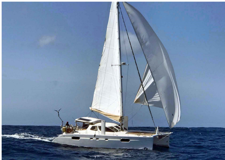
CATANA 471 N°47 *2002 € 370.000,-- 4sale at cat sale

All our immediately available offers of seaworthy Multihulls you'll find at: