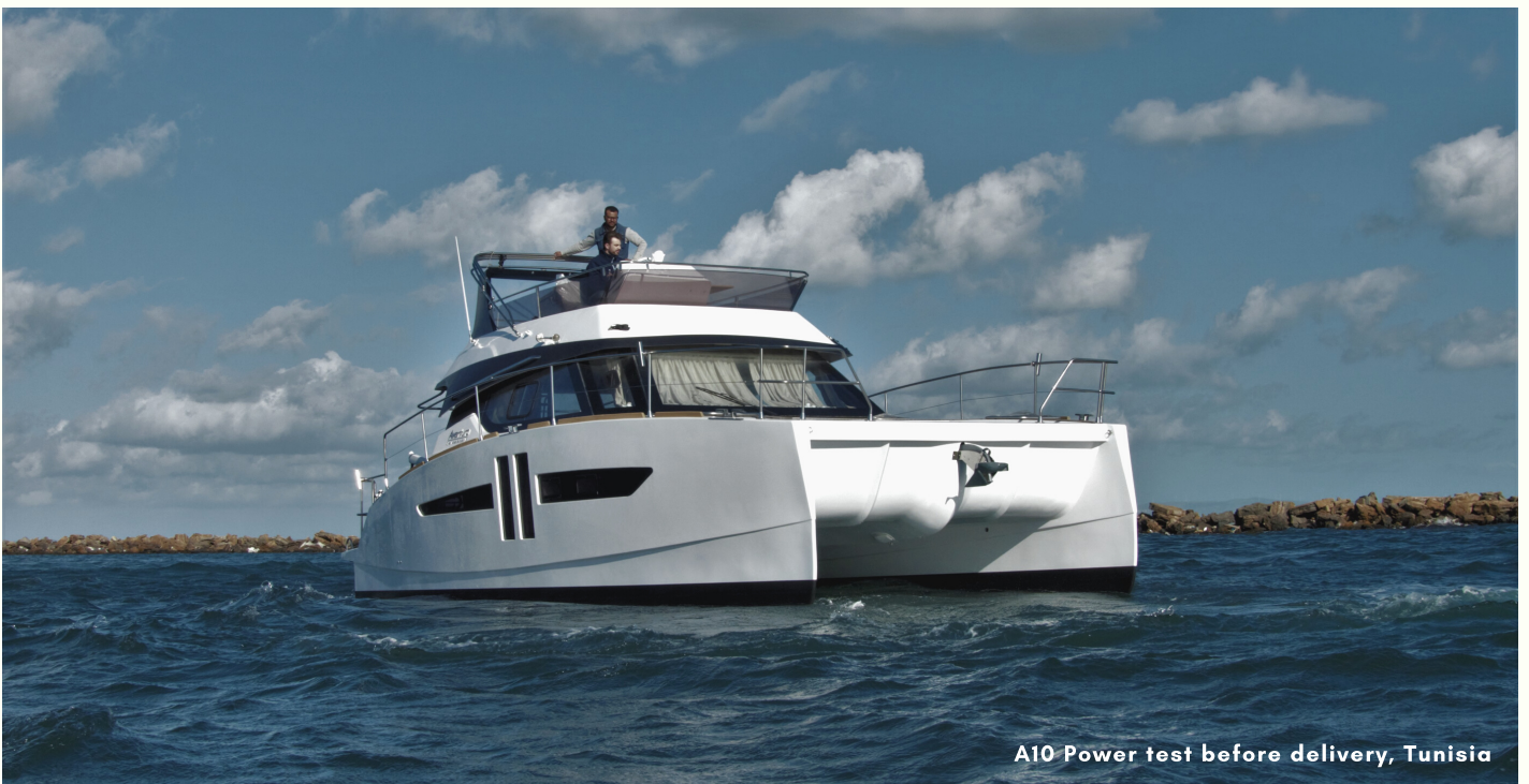
A10 Power test before delivery, Tunisia