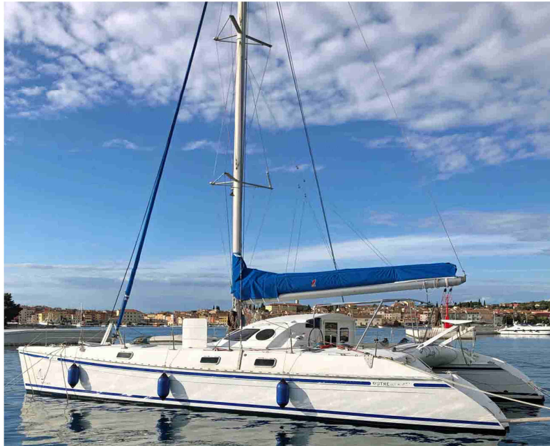
OUTREMER 45 N°15 / 2002 € 275.000,-- 4sale at cat sale