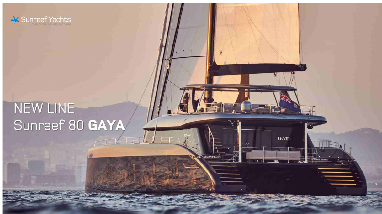
NEW Sunreef ECO-Line for a most comfortable life aboard in autarky now 4sale at cat sale

Restructured, this time brings us new tasks and incentives in our dedicated endeavour to serve our customers with the best multihulls. In contemplation, the view of familiar life is sharpened, and new decisions and innovations are possible. After three decades as a multihull broker and shipyard agency, cat sale offers an excellent selection of the best owner-oriented performance multihulls for long journeys. We advise you personally and comprehensively on your way on board. With experience and commitment, we help to find the ocean-going yacht that meets your requirements, for a safe life on board in the oceans and to define it in detail according to your wishes. Networked with the sailors, shipyards, designers and constructors of the multihulls, we work with passion for you.