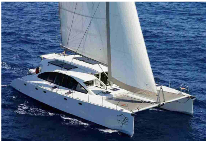
Dudley Dix DH 550 N°1 / 2016 € 695.000,-- 4sale at cat sale

You'll find all our immediately available, sound, ocean going Multihulls at: