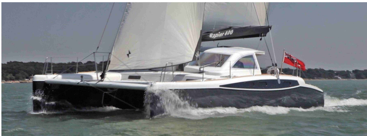
RAPIER 400 Performance Line by Broadblue, an open concept

The Broadblue 346 class A cruising cat , designed by Darren Newton / Dazcat-design, is built in Szczecin / Poland and combines latest design lines with English style and well-founded Polish boatbuilding. With a total length of just 10.2m, this catamaran offers excellent sailing performance. Designed for a maximum of six people in two double cabins aft and two single cabins in the bows, the interior is extremely voluminous and comfortable. Class-A certified for Ocean cruising, as well as, due to its compact width, suitable for inland areas and lock passages, this catamaran offers enormous potential for use.