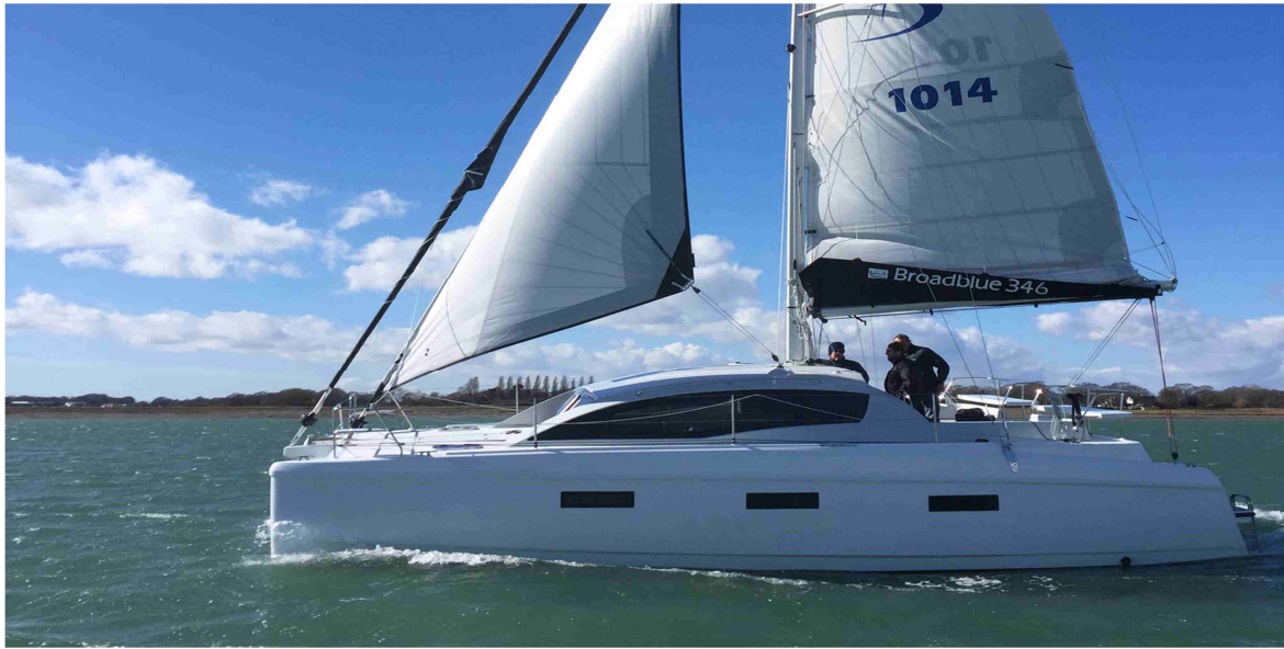
Broadblue 346 discovering the oceans in fresh lines, now 4sale at cat sale

The Broadblue 346 class A cruising cat , designed by Darren Newton / Dazcat-design, is built in Szczecin / Poland and combines latest design lines with English style and well-founded Polish boatbuilding. With a total length of just 10.2m, this catamaran offers excellent sailing performance. Designed for a maximum of six people in two double cabins aft and two single cabins in the bows, the interior is extremely voluminous and comfortable. Class-A certified for Ocean cruising, as well as, due to its compact width, suitable for inland areas and lock passages, this catamaran offers enormous potential for use.