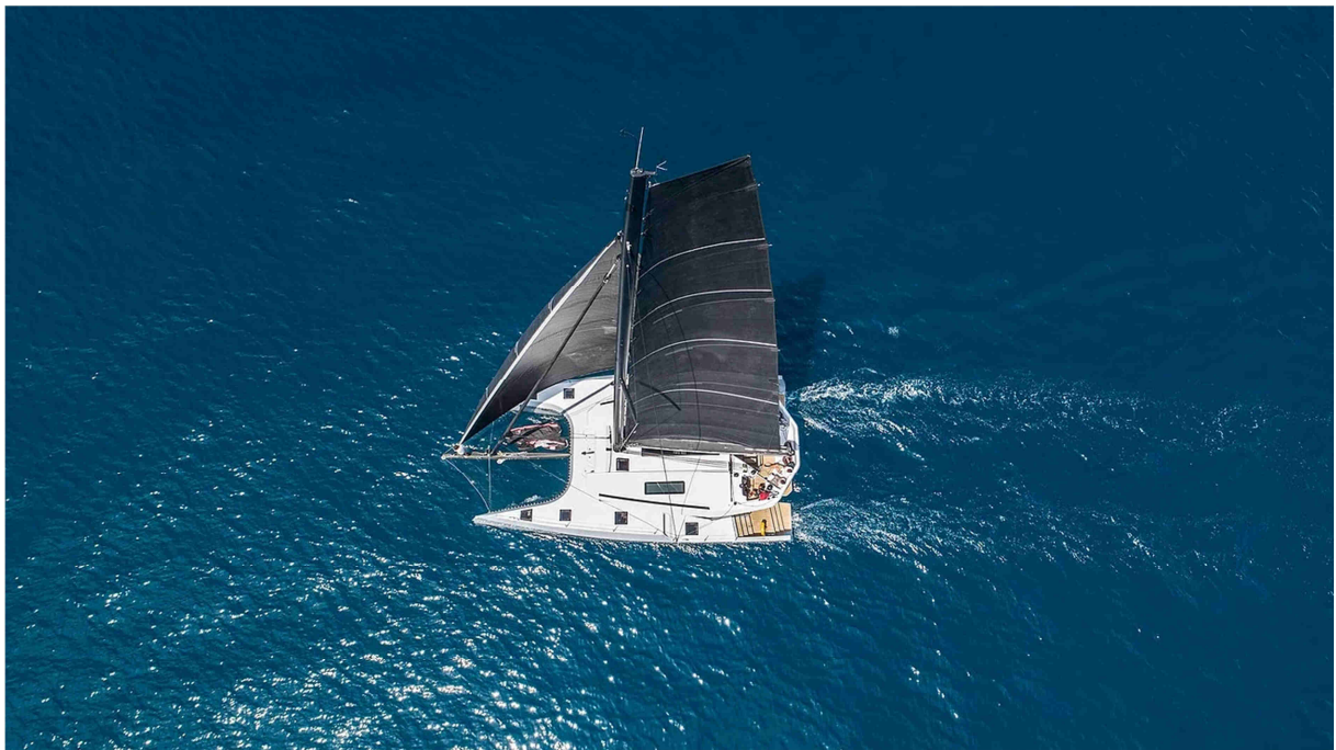
McConnaghy 52 available for first sea trials on the Med. with cat sale