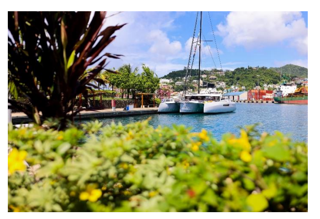
The NEEL 47 winner of the multihull category of the ARC Plus at anchor in Grenada.

The <u>NEEL 43</u>, the latest model of the range, has not yet taken part in the ARC, but has already crossed the Atlantic between Lisbon and Tortola, where she joined one of our <u>TRIMARAN YACHT CHARTER</u> bases.